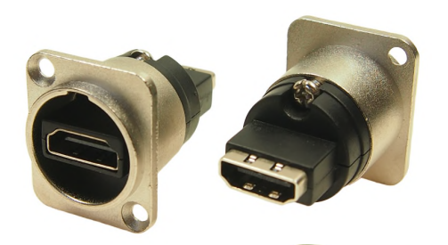
Part No. Description